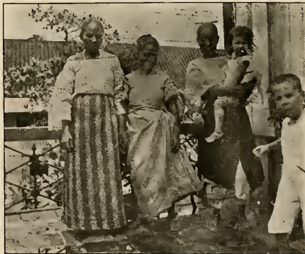
Our "Little Brown Sisters."